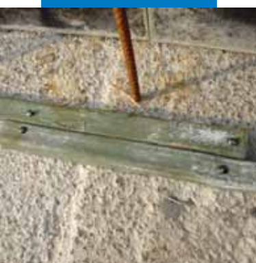
Overlapping the ends of Idrostop B25