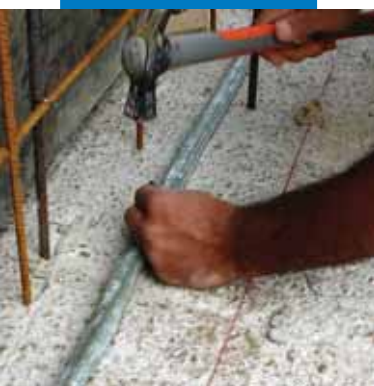
Fixing Idrostop B25 in place