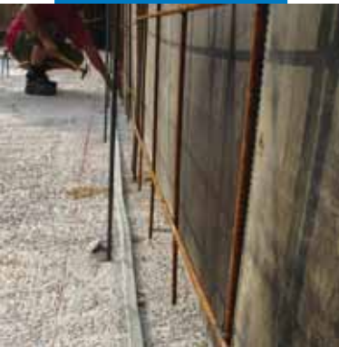
Laying Idrostop B25